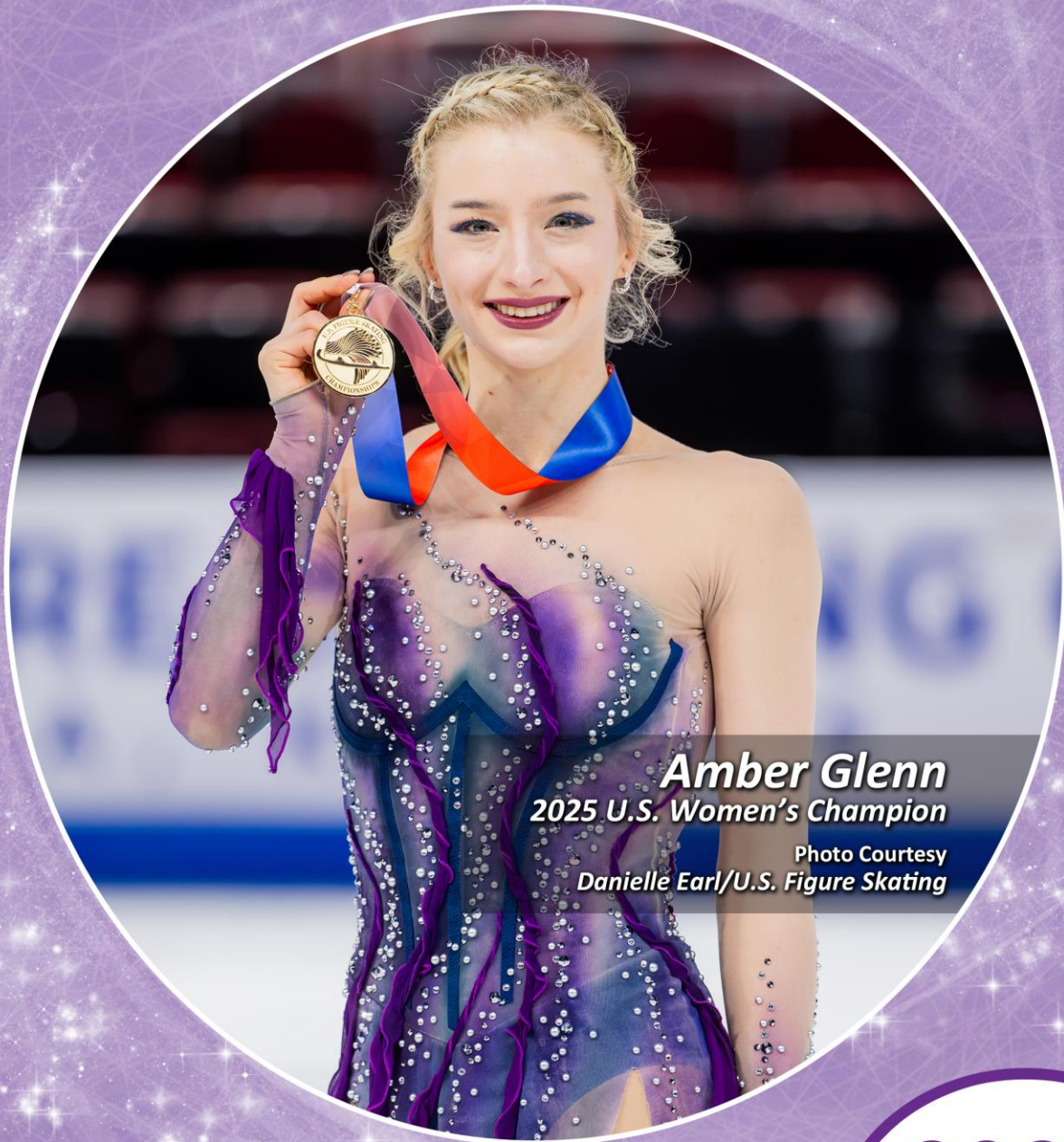
Amber Glenn 2025 U.S. Women's Champion